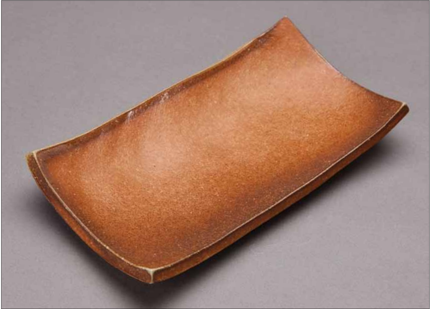
Shiho sara (Rectangular platter) 1.5 x 10 x 5.25" KJ130