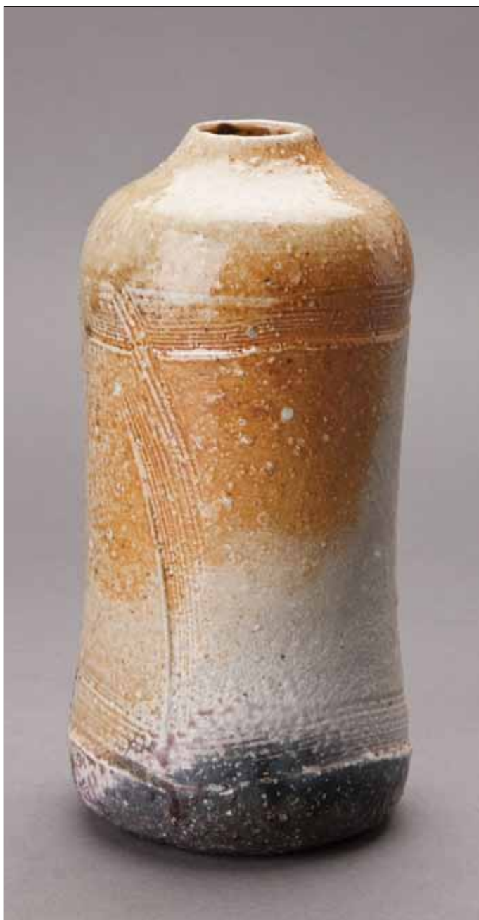
Hanaike (Vase for flower arrangement in tea room) 9.5 x 4.5 x 4.5" KJ92