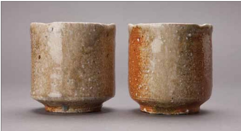
Yunomi (Tea cup) 3.75 x 3.5 x 3.5" KJ126