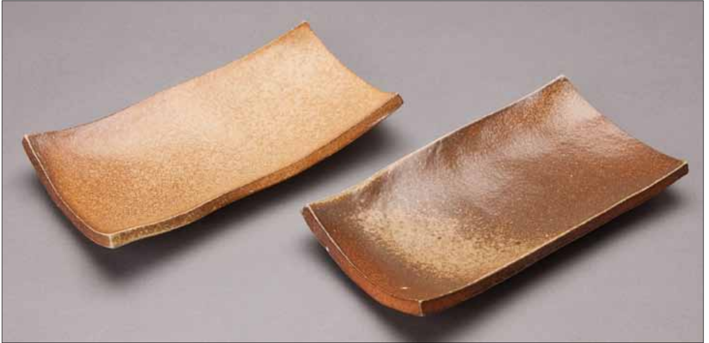
Shiho sara (Rectangular platter) 1.5 x 10 x 5.25" KJ140