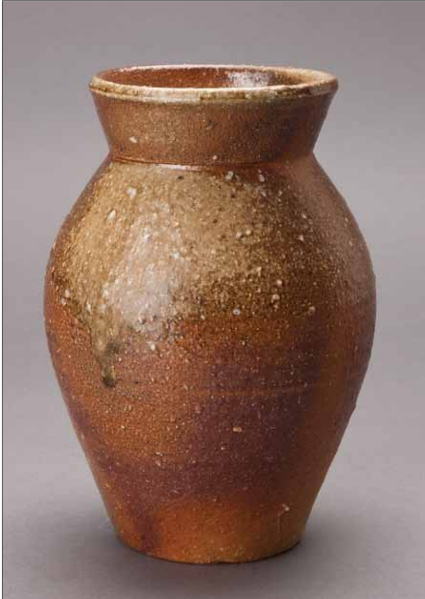
Tsubo (Jar) 9 x 6.25 x 6.25" KJ89