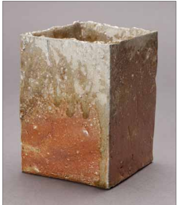
Kabin (Square vase) 5.5 x 4 x 4" KJ113