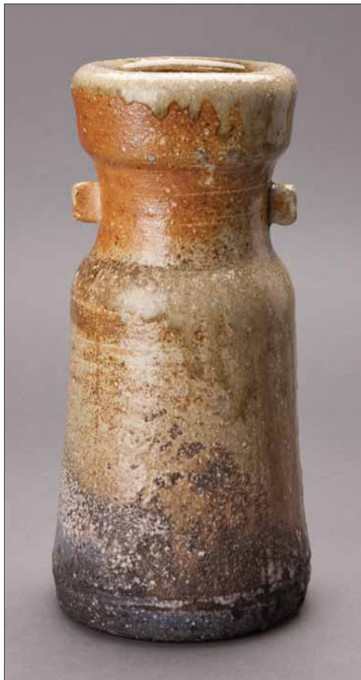
Iga hanaire (Flower vase for tea ceremony in Iga style) 12 x 5.5 x 5.5" KJ106