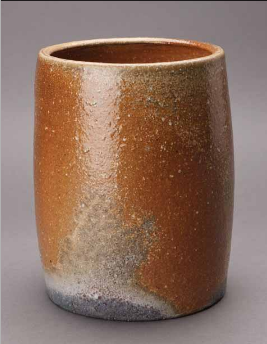
Kyozutsu (Sutra scroll container) 11 x 8.25 x 8" KJ105