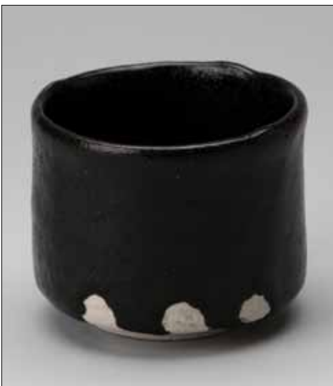
Chawan, hikidashi-guro (Tea bowl, pulled-out black glaze) 3.5 x 4.5 x 4.5" KJ73