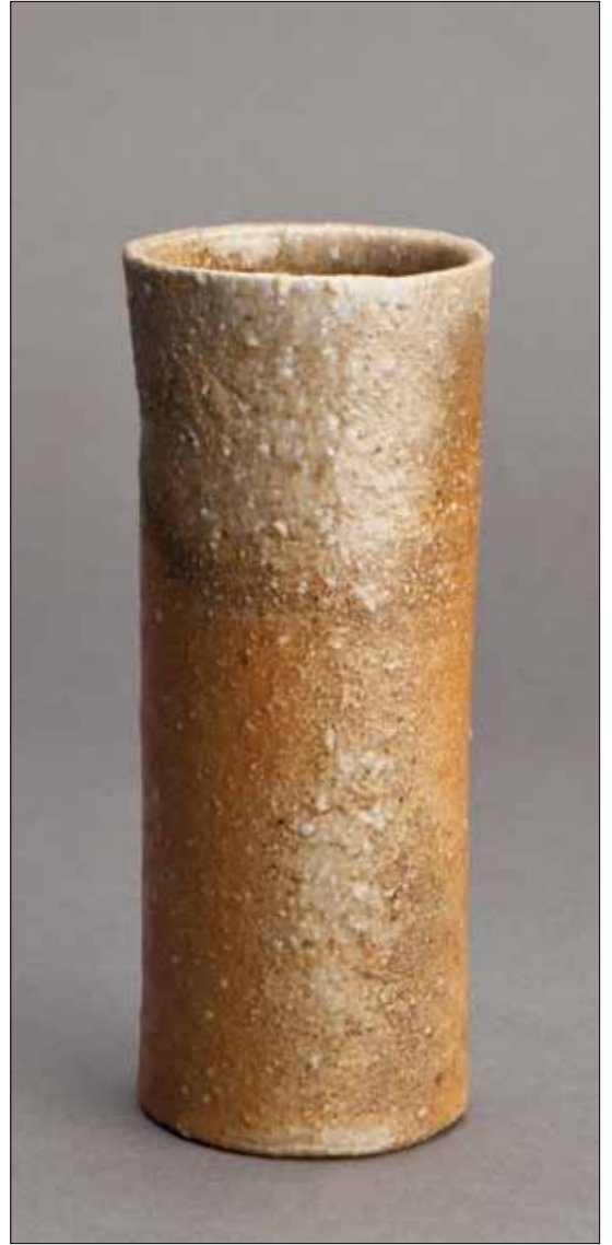
Kake-hanaike (Hanging flower vase) 7.5 x 3 x 3" KJ72