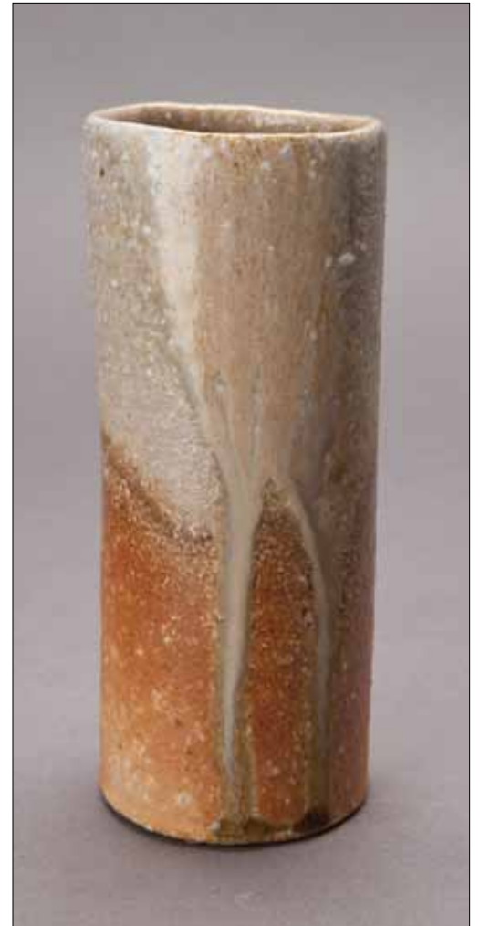
Kake-hanaike (Hanging flower vase) 7.5 x 3.25 x 3" KJ116