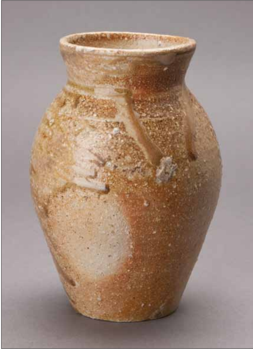
Tsubo (Jar) 8.5 x 5.75 x 5.5" KJ88