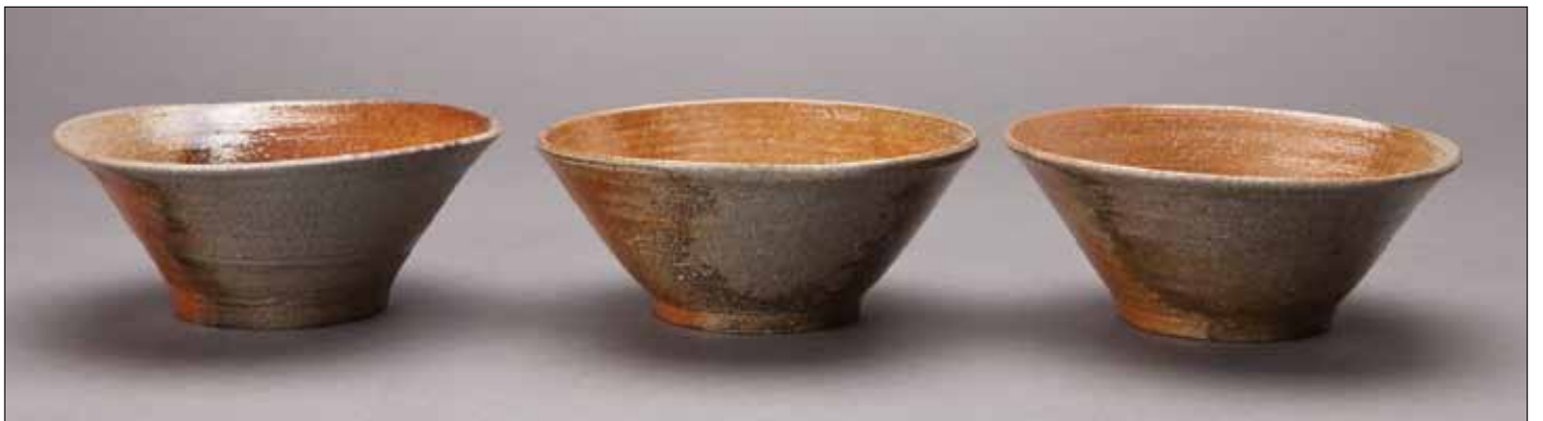
Yama-jawan (Rice bowl) 2.75 x 6.25 x 6.25" KJ133