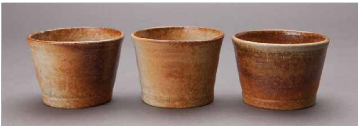
Yunomi (Tea cup) 2.5 x 3.75 x 3.75" KJ120