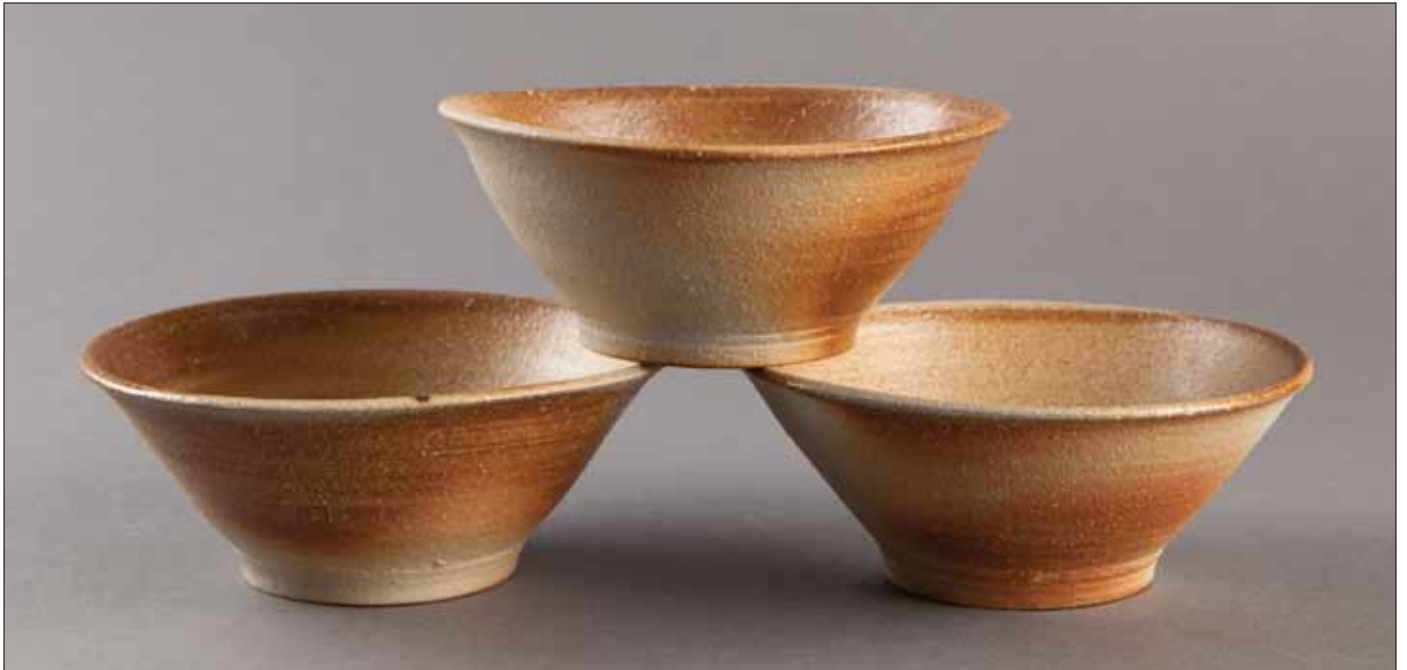
Yama-jawan (Rice bowl) 2.5 x 6.5 x 6.25" KJ78