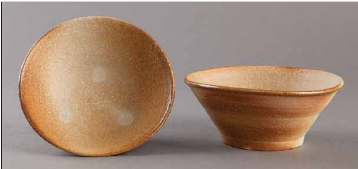
Yama-jawan (Rice bowl) 2.5 x 6.25 x 6" KJ83