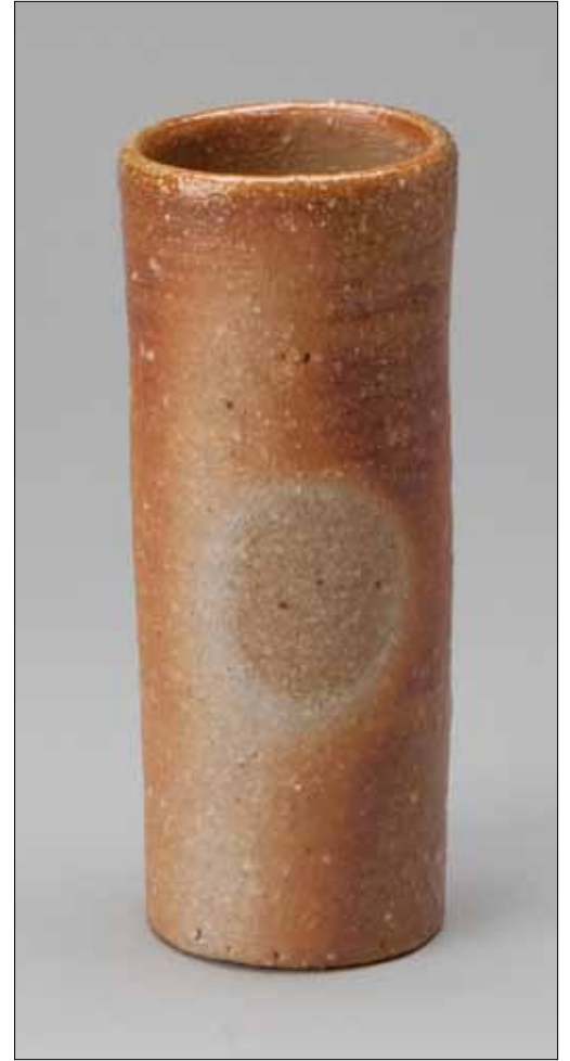
Kake-hanaike (Hanging flower vase) 7.5 x 3 x 3" KJ71