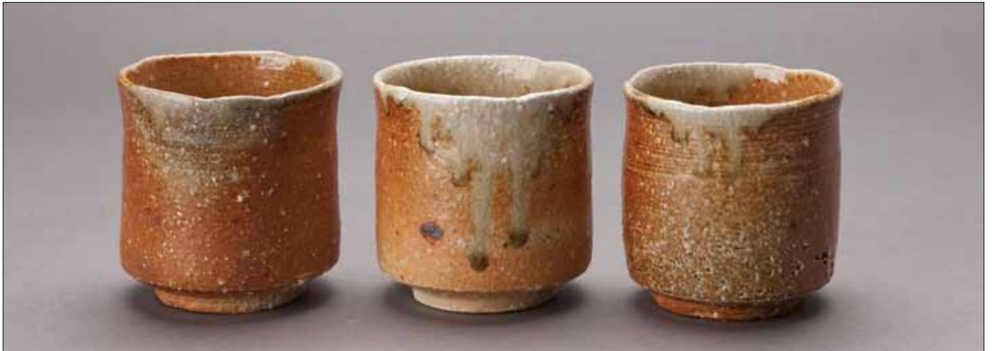
Yunomi (Tea cup) 3.5 x 3.75 x 3.5" KJ129