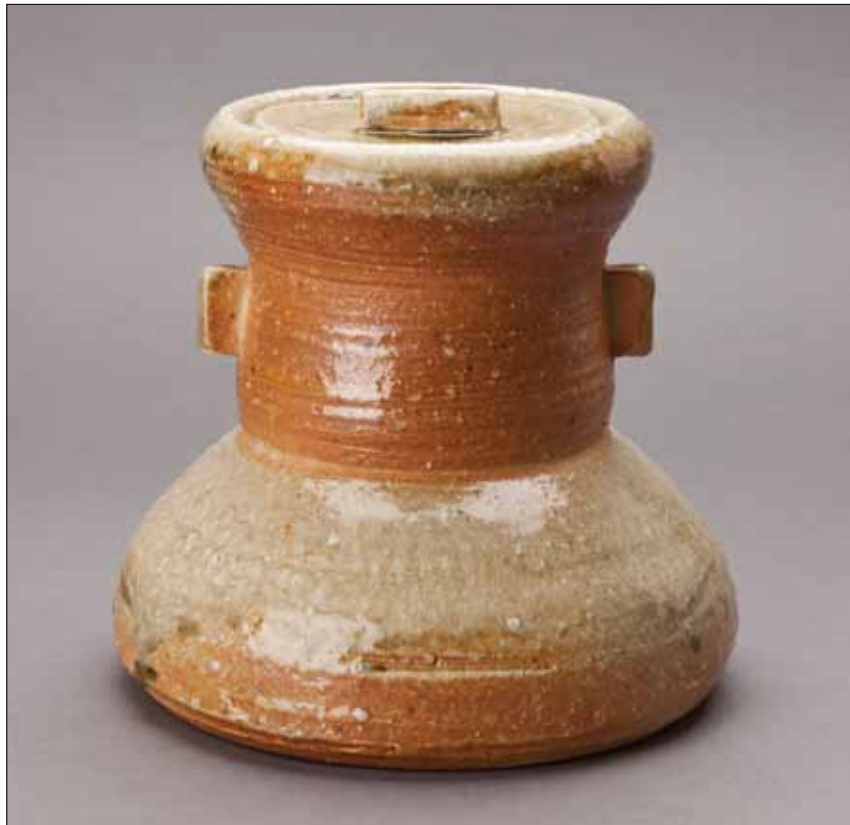
Mizusashi (Water container) 8.5 x 7.5 x 7.75" KJ99