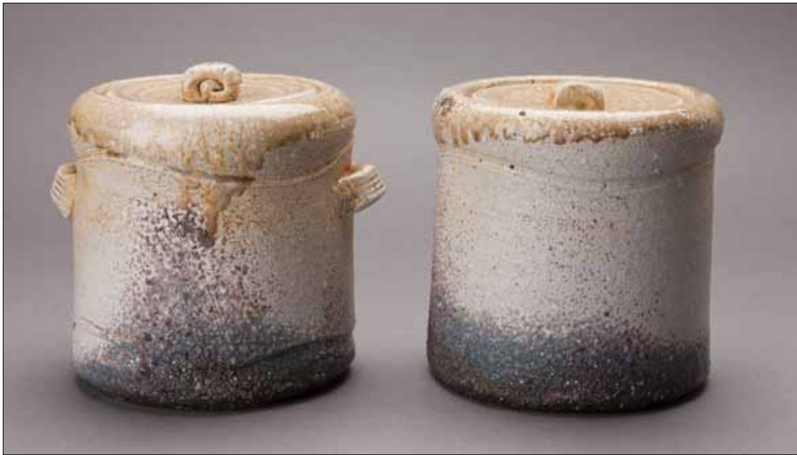
Mizusashi (Water container) 8 x 8.25 x 6.75" KJ96