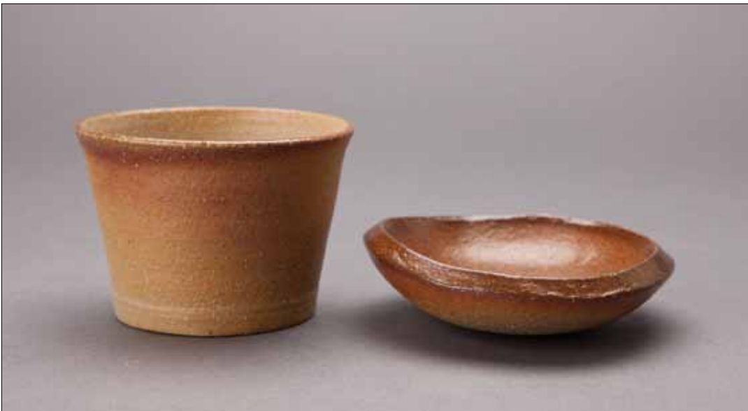
Yunomi (Tea cup) 2.5 x 3.75 x 3.75" KJ122