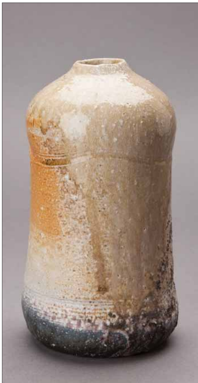
Hanaike (Vase for flower arrangement in tea room) 8.75 x 4.75 x 4.5" KJ93