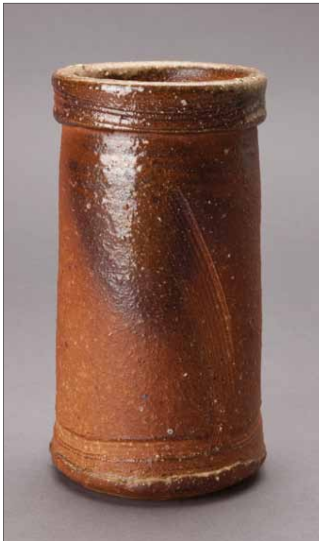
Iga hanaire (Flower vase for tea ceremony in Iga style) 8 x 4 x 4" KJ87