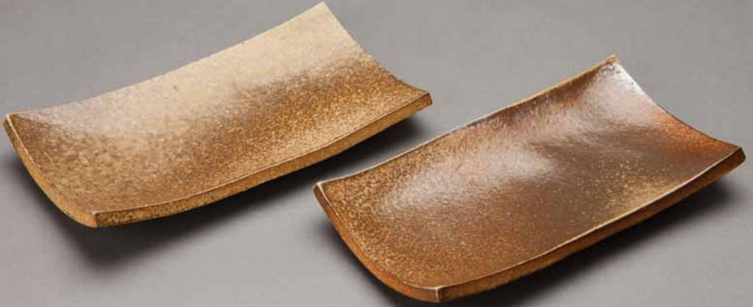
Shiho sara (Rectangular platter) 1.75 x 10 x 5.25" KJ139