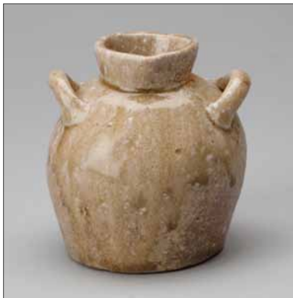
Ohaguro tsubo (Small jar to hold tooth-blackening material) 4.75 x 4.25 x 4.25" KJ75

Ohaguro is a custom of dying one's teeth black using iron filings dissolved in vinegar. It was popular in Japan until the Meiji Era.