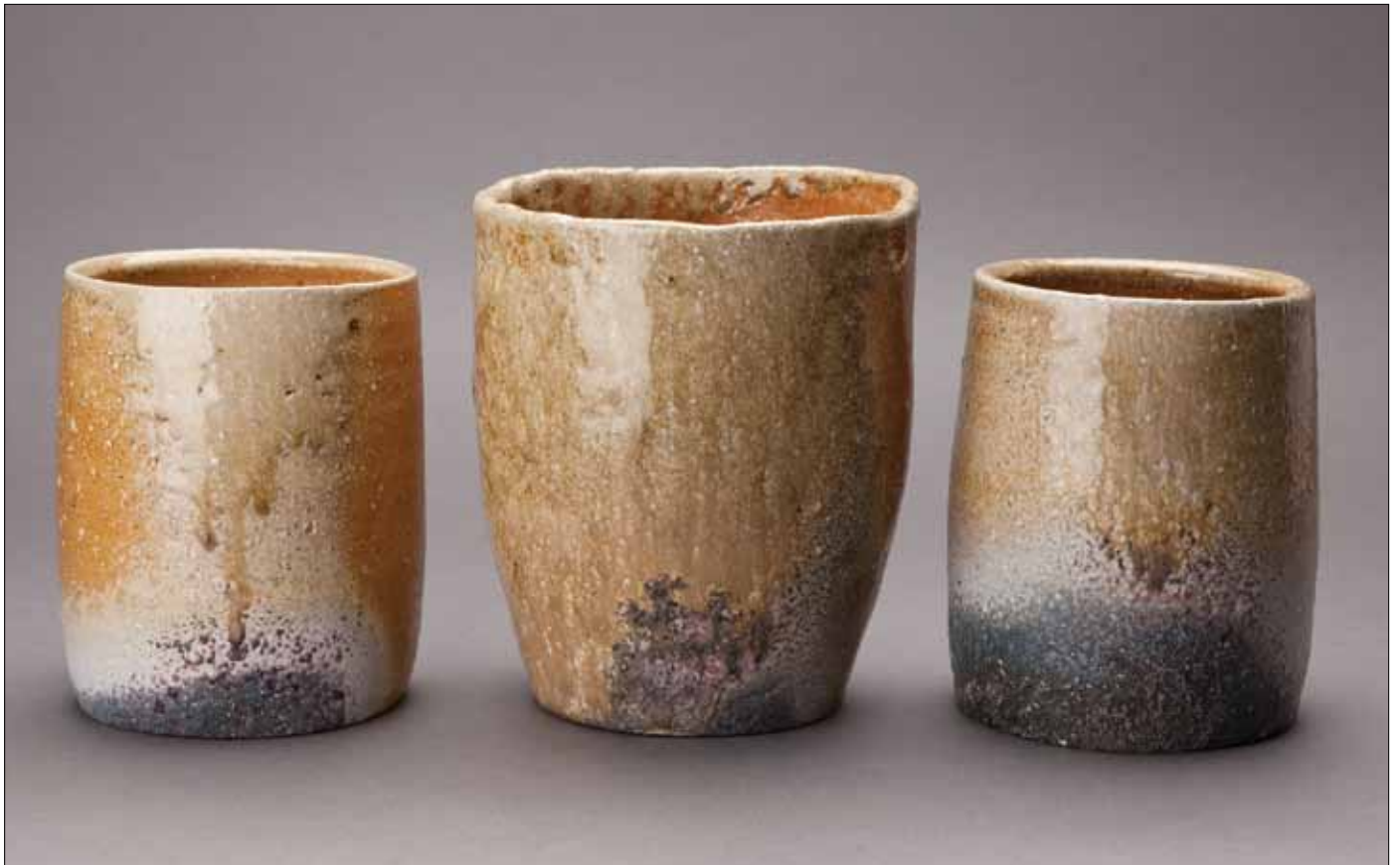
Kyozutsu (Sutra scroll container) 7.5 x 6 x 6" KJ91