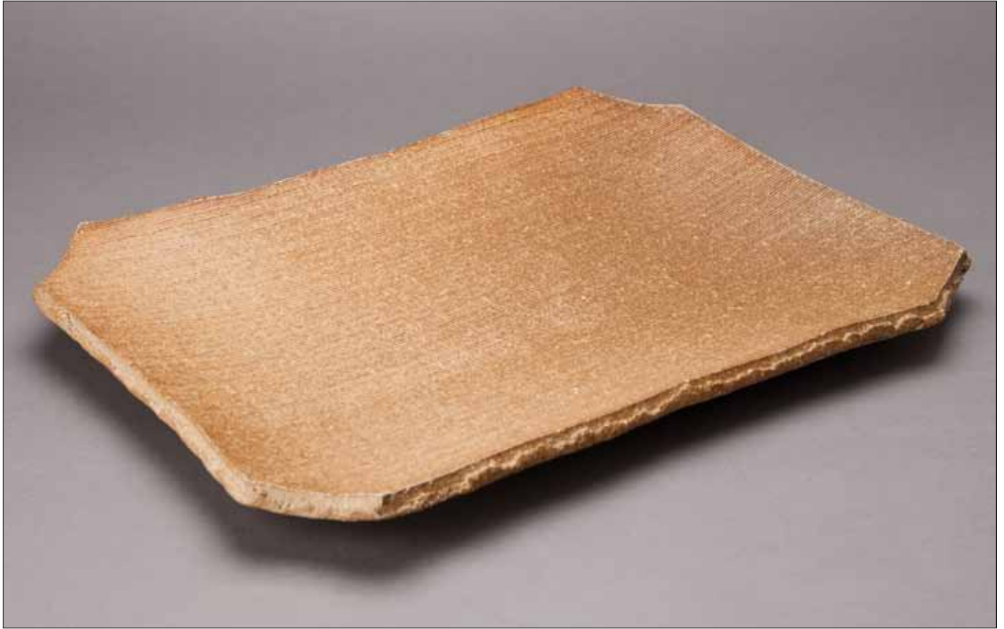
Shiho sara (Rectangular platter) 1.75 x 22.25 x 15.75" KJ110