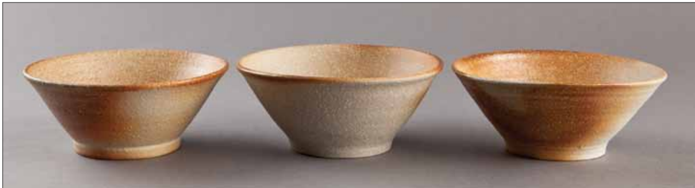
Yama-jawan (Rice bowl) 2.5 x 6 x 6" KJ80