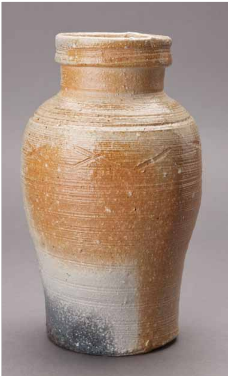
Iga hanaire (Flower vase for tea ceremony in Iga style) 11 x 6.25 x 6.25" KJ112