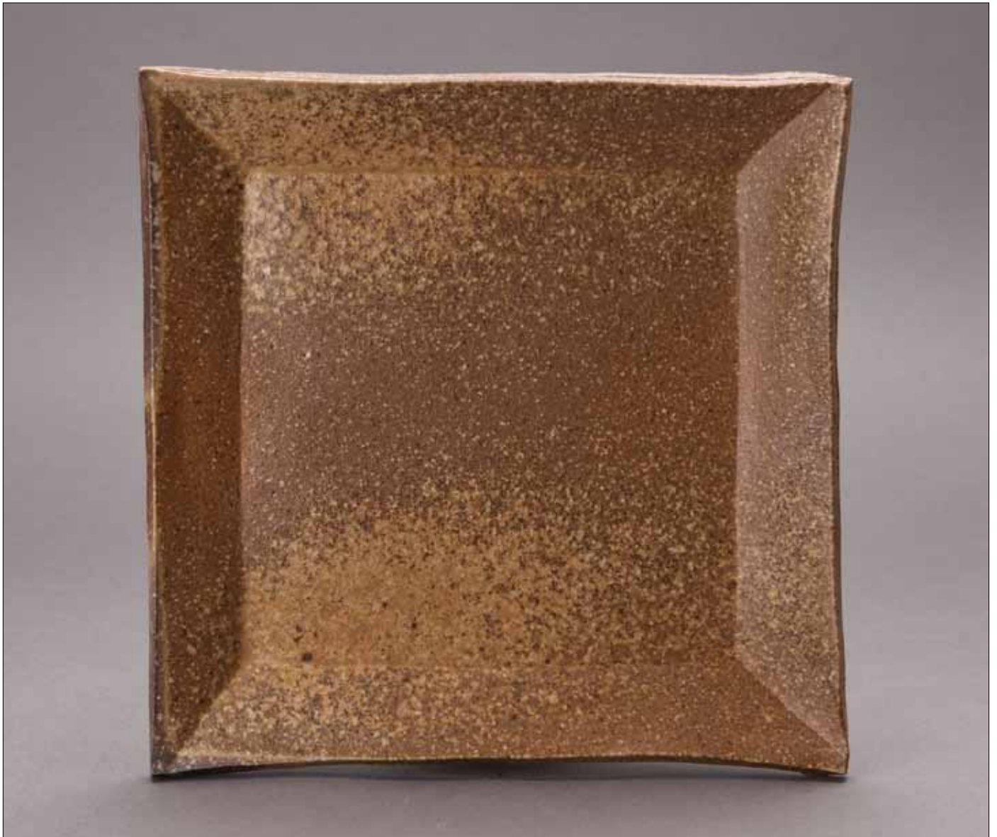
Sara (Square plate) 1.5 x 10.25 x 10.25" KJ109