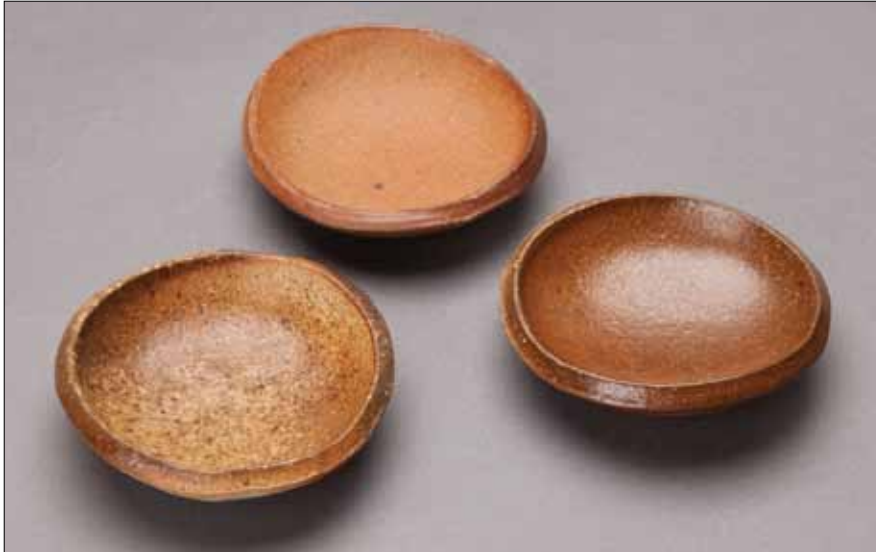
Sara (Small dish) 1.5 x 4.25 x 4.25" KJ117