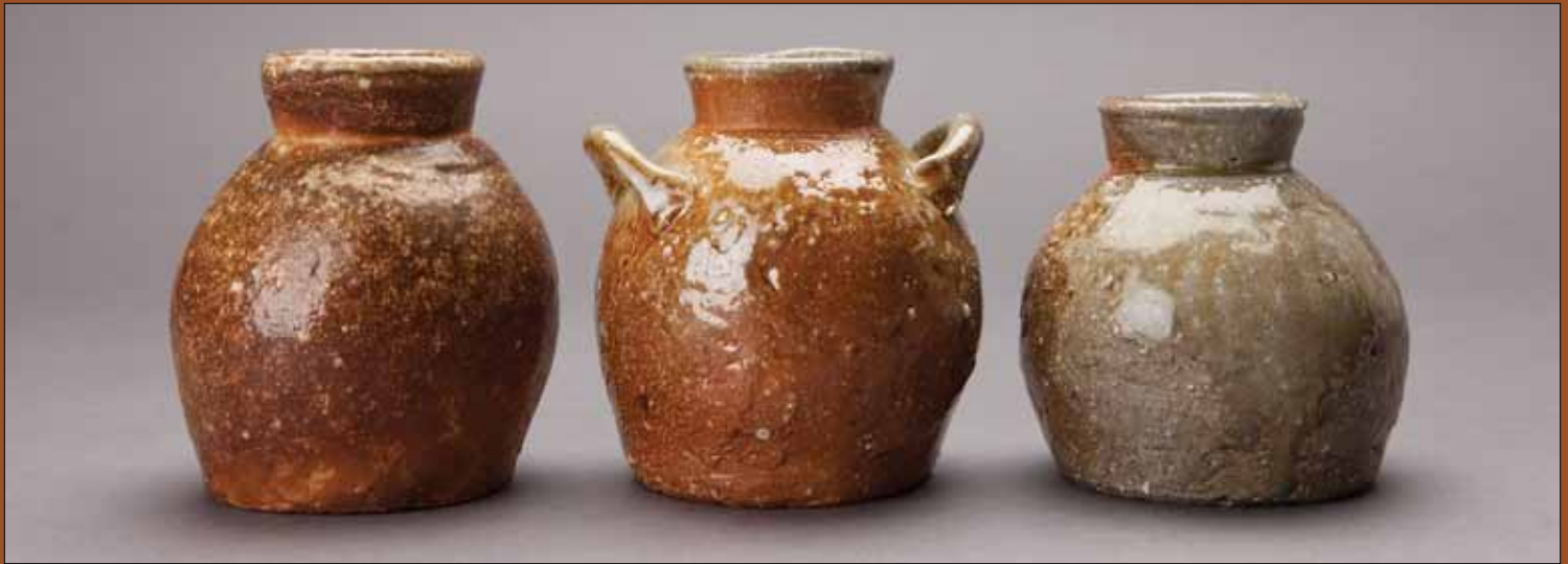
Ohaguro tsubo (Small jar to hold tooth-blackening material) 4.75 x 4 x 3.75" KJ103