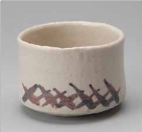
Chawan (Tea bowl), white feldspathic glaze with iron underglaze brushwork 3.75 x 5 x 5" KJ74