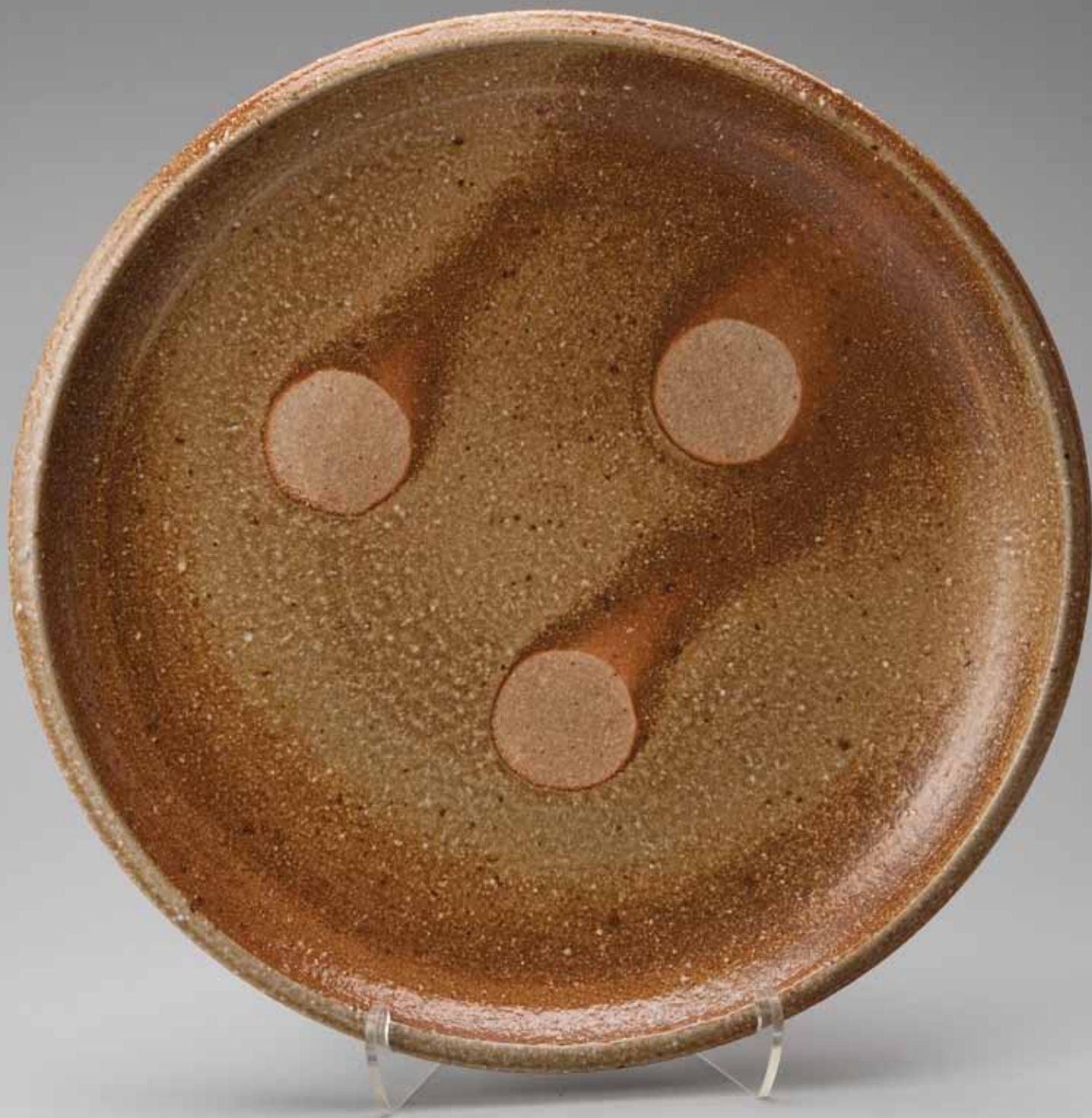
Sara (Plate) 2.25 x 18 x 18" KJ70