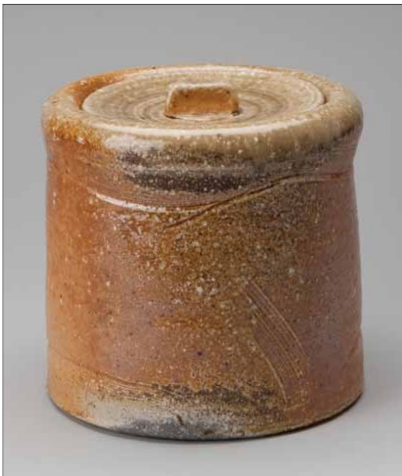
Mizusashi (Water container) 8 x 8.5 x 8.5" KJ68

in accordance with a conviction put forward in Goethe's Maxims and Reflections , where he stated that an able pigment grinder can sometimes become an outstanding painter.