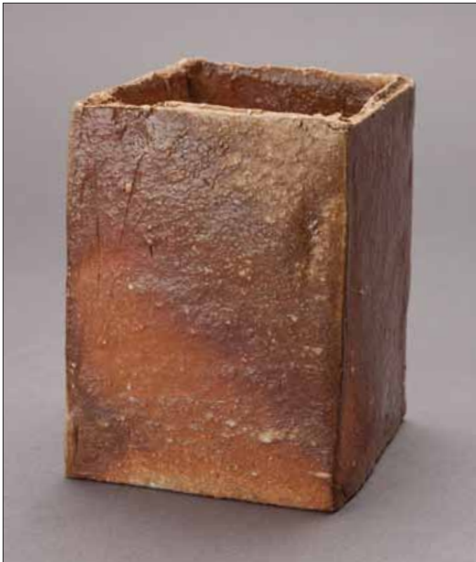
Kabin (Square vase) 5.25 x 3.75 x 3.75" KJ114