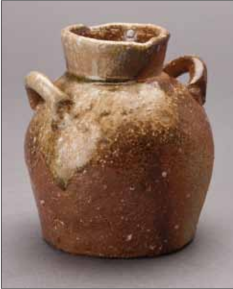
Ohaguro tsubo (Small jar to hold tooth-blackening material) 4.5 x 3.75 x 4" KJ104