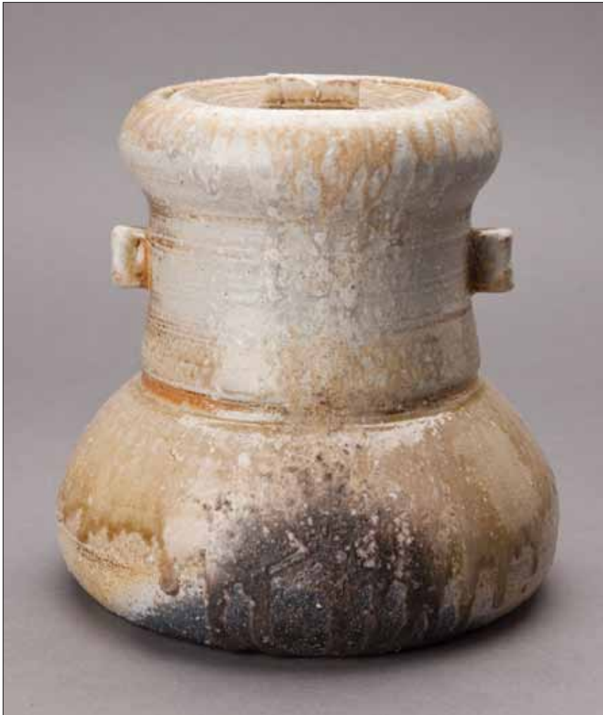
Mizusashi (Water container) 8.25 x 7.5 x 7.5" KJ100