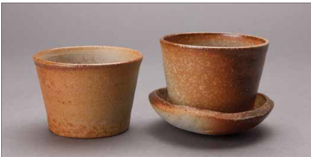
Yunomi (Tea cup) 2.5 x 3.75 x 3.75" KJ123

At first glance, it may appear that there has been little evident development in the artist's work over the past 25 years. A closer inspection reveals that Kollwitz has managed to obtain new, subtle nuances of color from the firing. Colors, ranging from a warm pale tan through red-brown to black and purple-grey, have become richer, ash deposits have become thicker, and seemingly random distortions have become more natural. Clearly, Kollwitz is not seeking sensation or superficial effect, nor easily achieved results, nor variety and individuality. Instead, he is interested in a gradual improvement in quality, in achieving artistic substance through an unwavering command of craft skills