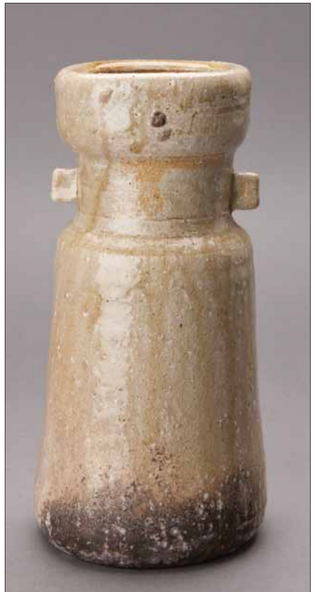
Iga hanaire (Flower vase for tea ceremony in Iga style) 11.5 x 5.5 x 5.75" KJ107