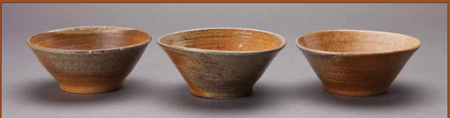
Yama-jawan (Rice bowl) 2.5 x 6.25 x 6.25" KJ131

The public is invited to attend. The artist will be present.