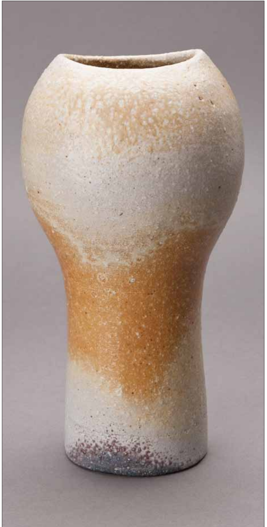
Hanaire (Vase), Jomon style 12 x 6 x 6.25" KJ111